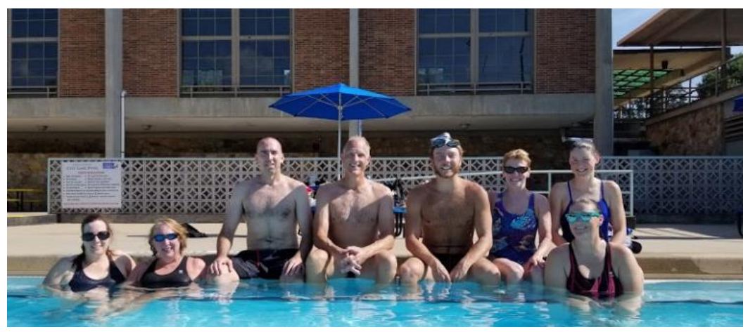
Happy GCY Masters after swimming 76 X 50 @ :60 LC on July 4, 2018 at City Lake Pool in Jamestown, NJ