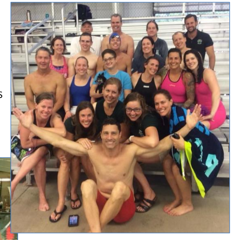
New World Record for the Men's 4x100m Medley Relay (4:36.68)