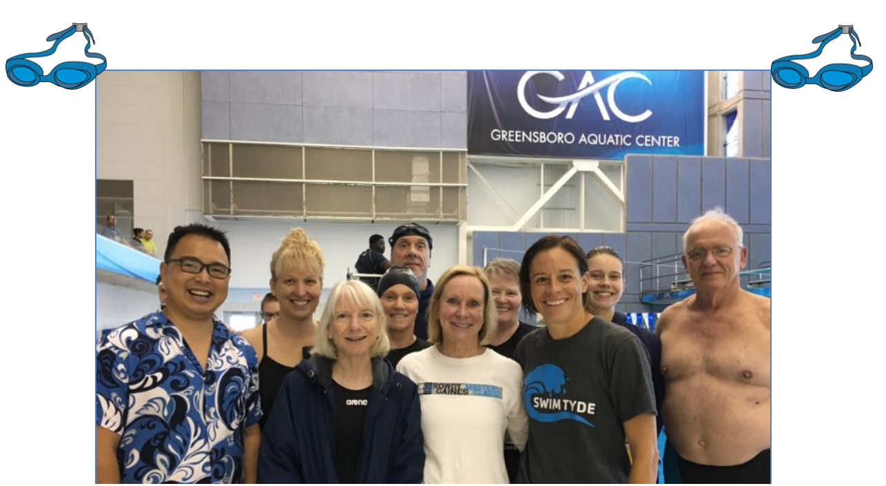
Happy NCMS'ers after swimming 1st day of Powerade State Games on June16, 2018 at Greensboro, NC